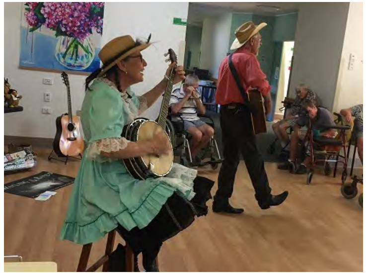
Visit from Bow and Curtsy