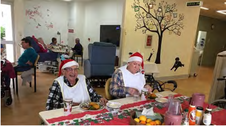
Christmas in July

Christmas in July was an event that kept both residents and their carers entertained and socially active. The residents and family enjoyed a Christmas lunch with all the trimmings and all were able to have a laugh and a chat together.