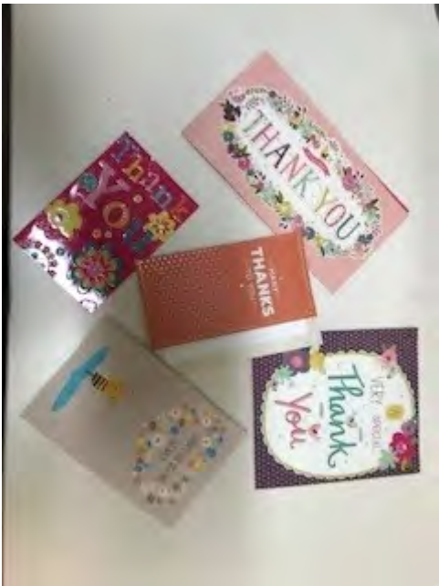
A selection of thank you cards received by staff

Warialda MPS would like to acknowledge and thank the following people and community groups for their continued support throughout the year: