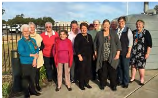
United Hospital Auxiliary

The Warialda Auxiliary works tirelessly throughout the year raising funds for much needed equipment for the MPS.