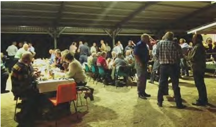
Men's health night participants

The major highlight for community health has been the men's health night. This event is held annually as a men's health initiative and has grown each year. This year the men's health night was awarded Event of the Year at the local Australia Day Awards.