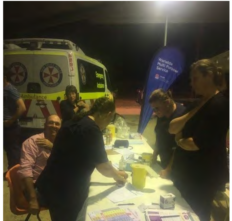
Warialda MPS staff administering free flu vaccinations

"I brought my wife this year, because she didn't believe me that we get this info / flu shot, and the speakers are brilliant" aged 67