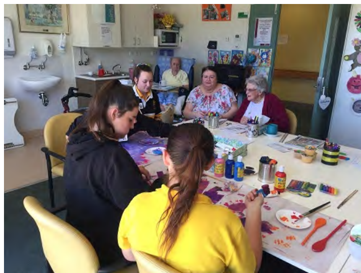
Students visit the MPS

Warialda MPS is pleased to welcome visits from our local schools. The residents enjoy their interaction with the younger generation.