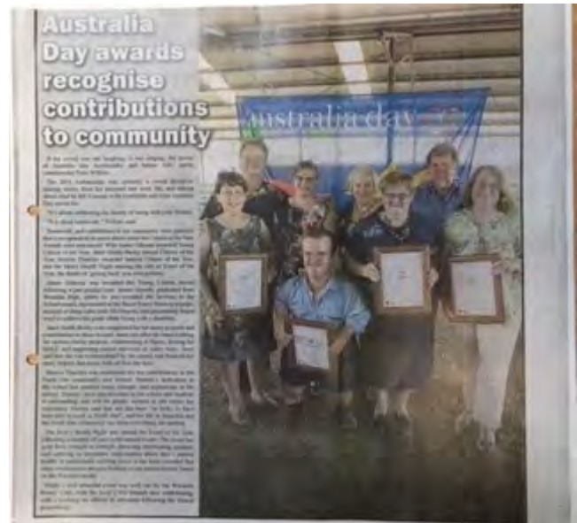
Newspaper article regarding the awards