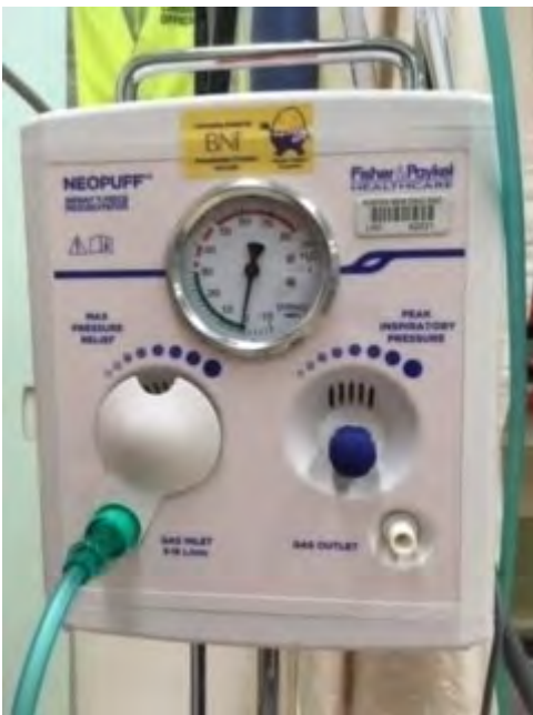
Neo puff donated through Humpty Dumpty Foundation

We are grateful to the Humpty Dumpty Foundation and Business Network International (BNI)- Presidential Chapter Kirribilli.