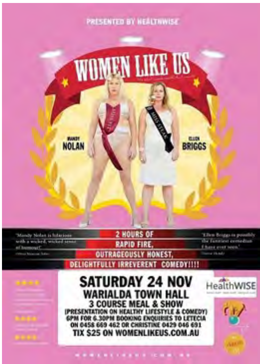
Women's health night