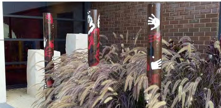
Totem handprint art by Hunter River High School Students as part of Koori Youth Health Workshop 2017.

Raymond Terrace Health Centre is located in Worimi country. We pay our respects to the elders past, present and emerging. We pledge our commitment to closing the gap between the health status of Aboriginal and non-Aboriginal people in our local area.