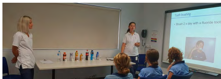
Oral Health Education Session