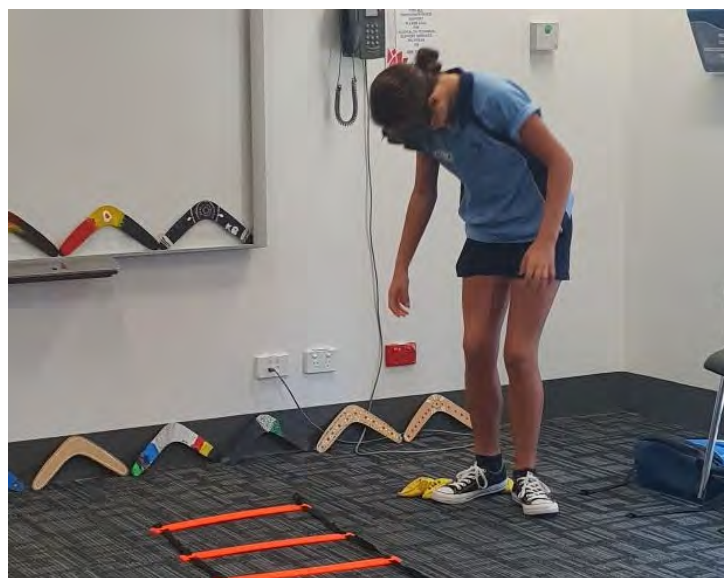
Beer Goggle Obstacle Course

Improving the health status of the local Aboriginal community is a high priority for Raymond Terrace Health Centre. One of